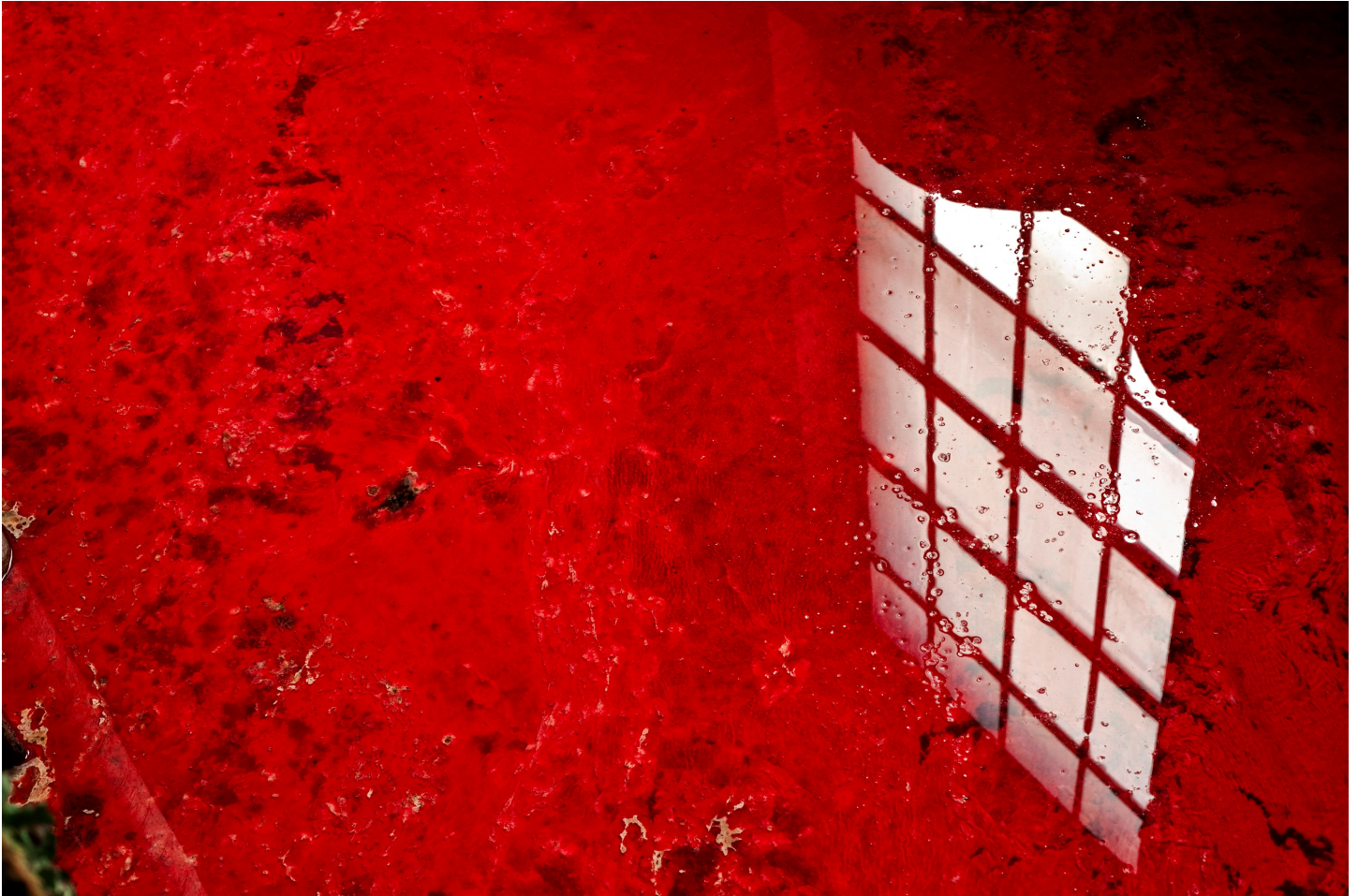
HARLEM VALLEY / WINGDALE PROJECT # 9334 BUILDING 34- POWER PLANT (TOXIC OIL SPILL WITH BACTERIAL MAT BELOW CONSUMING IT....)

AND HOW FINE A PLACE THE HOUSE SEEMED TO ME NOW THAT IT WAS IMPERCEPTIBLY NEARING THE BRINK OF DISSOLUTION AND SILENT OBLIVION.