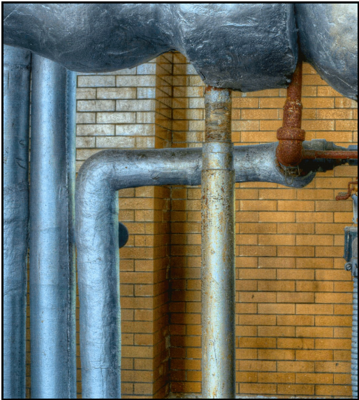
HARLEM VALLEY / WINGDALE PROJECT (ARCHIVAL PIGMENT PRINT, 2011)

NEW SUGGESTS A COMPARISON WITH DANZIGER’S “TIME-POUNDED” RENDITION OF A SIMILAR SCENE FOUND IN THAT DECREPIT MENTAL FACILITY.