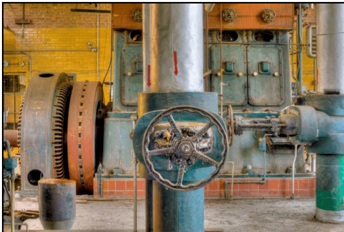
HARLEM VALLEY / WINGDALE PROJECT #7146 (ARCHIVAL PIGMENT PRINT, 2011)