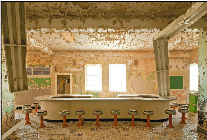
HARLEM VALLEY / WINGDALE PROJECT #8312 BUILDING 35, SMITH HALL (ARCHIVAL PIGMENT PRINT, 2011)

THESE SPACES — DEVOID OF PEOPLE, BUT NOT MEMORIES — REVEAL GRAFFITI AND MESSAGES OF DESPERATION FROM LONG-GONE INMATES, IN A PLACE WHERE TIME WOULD SEEM TO HAVE STOOD STILL. IN THESE IMAGES ONE SENSES MOST DIRECTLY A CAPACITY TO REGISTER THE PERSISTENCE OF PAST SUFFERING AS ABSORBED INTO THE SUBSTANCE OF LIVED SPACE, INTO THE SETTING OF HUMAN HISTORY; YET GIVEN THE ARTIST'S SKILL IN POETIC VISUALIZATION, THE "EXISTENCE OF THE HORRIBLE IN EVERY ATOM OF AIR" THAT SO PERVADES THESE SPACES HAS BEEN AESTHETICALLY REDEEMED.