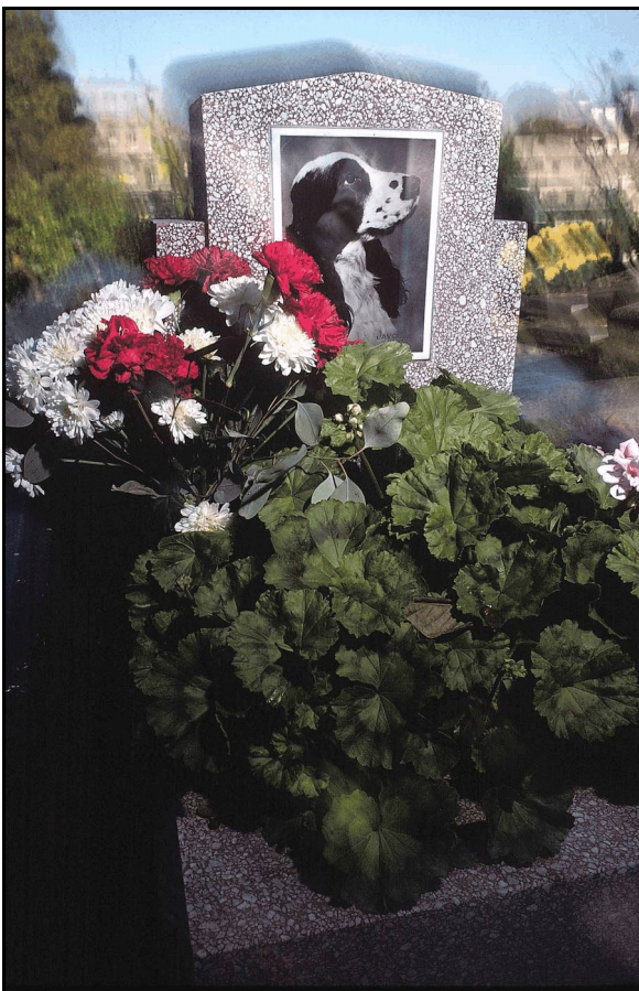
COEUR FIDELE SERIES (CIBACHROME, 1980)

IN HIS EARLIER WORK DATING FROM THE MID-1970S, DANZIGER OFTEN MELDED HAND-HELD TIME EXPOSURES WITH FLASH-FILL, CREATING HYBRID EXPOSURES. HERE FLASH PROMISES INSTANT REVELATION OF TRUTH, WHILE THE TIME-EXPOSURE ENDEAVORS TO REGAIN SOME OF THE FEATURES THROUGH WHICH PAINTING TRADITIONALLY ENACTS TIME. HENCE, THE “REALITY” OF THE SUBJECT PHOTOGRAPHED IS QUESTIONED. SUCH EXPOSURE HYBRIDIZATION IS FOUND IN THIS ARTIST’S COEUR FIDELE SERIES FROM THE EARLY 1980S. DANZIGER (BORN IN CHAPEL HILL, NORTH CAROLINA, RESIDING IN LOS ANGELES AT THE TIME OF THIS EARLIER