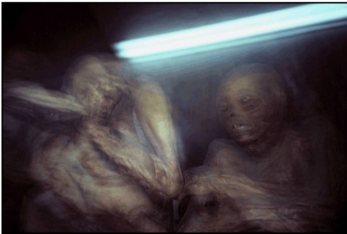
MUMMY # 1, GUANAJUATO, MEXICO (CIBACHROME, 1976)

PRODUCTION, NOW BASED ON THE EAST COAST) TRAINED HIS CAMERA FROM A HIGH ANGLE DOWN ONTO ORNATE PET GRAVES IN PARIS'S OLDEST PET CEMETERY. UNLIKE HIS CURRENT SUBJECT, THESE GRANITE-INSCRIBED, THE HEADSTONES RESIST BECOMING RUSTED OUT RUINS AND ATTEMPT TO COUNTER THE MORTALITY OF THE ANIMAL BURIED BENEATH, TESTIFYING TO THE ENDURING FAITHFULNESS OF THE BELOVED PET TO ITS OWNER WHO HAS RETURNED THE FAVOR BY ATTACHING A PHOTO-CERAMIC OF THE ANIMAL TO THE COLORFUL FLOWER-SURROUNDED HEADSTONE. ALL THIS SENTIMENTALISM PLAYS UPON CEMETERY VISITORS' HEARTSTRINGS. YES, IT'S ALL KITSCHY SUBJECT MATTER, BUT THIS IS WHAT ATTRACTED THIS PHOTOGRAPHER'S SLY EYE — JUST AS DID THE TIME-DISSOLVED INSTITUTIONAL STRUCTURES HE NOW SHOOTS.