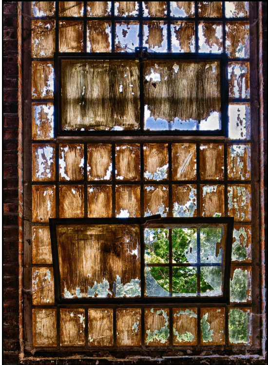
HARLEM VALLEY / WINGDALE PROJECT #9334 BUILDING 35, POWER PLANT I (DETAIL, ARCHIVAL PIGMENT PRINT, 2011)

EFFECTS ACHIEVED THEREWITH, AS WELL AS HIS CREATION OF INTENSE, EXAGGERATED COLOR.