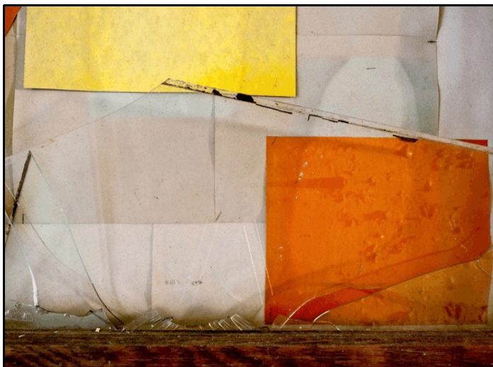
HARLEM VALLEY / WINGDALE PROJECT #8357 (ARCHIVAL PIGMENT PRINT, 2011)

THROUGHOUT HIS PRODUCTION, DANZIGER MAKES US AWARE OF THE DISJUNCTION BETWEEN PHOTOGRAPH AND REFERENT. SCENES BECOME MEANINGFUL ONLY IN, AND AS, ITS REPRESENTATION. IN THIS LATEST SERIES, HE PROBLEMATIZES FIGURE/GROUND RELATIONS, OR COLLAPSES THEM FLAT, EMPLOYING THE GREENBERGIAN TERMS OF HIGH MODERNIST ABSTRACT PAINTING TO IMAGE THE COLLAPSING INSTITUTIONAL SITE HE'S