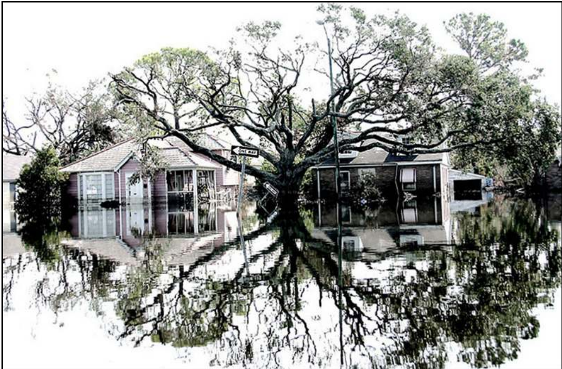
Canal Street, New Orleans, Louisiana (2005)