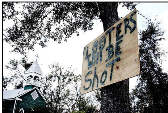
Pearl River, Louisiana (2005)