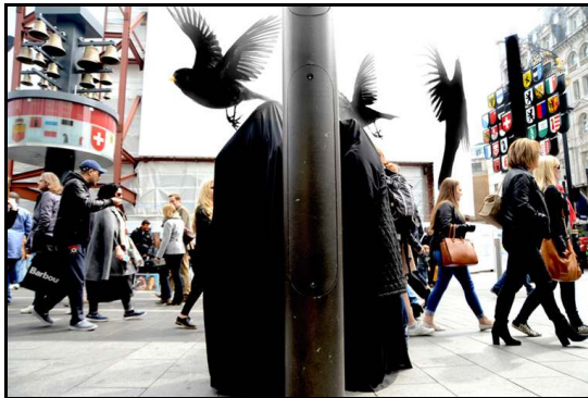
Murmuration of Fear, London, England (2015)