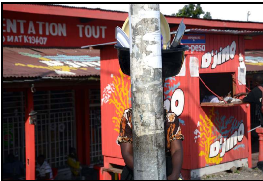
Goma, Democratic Republic of the Congo (2015)

Travelogueing the Dark Side: The ExtremeOphile Field Notes of a One-of-a-Kind Lifetime Art Project is a tome recording this intrepid photographer's adventures across time and space, a sedimentation in paper and ink of his multifarious performances as a global street photographer, where danger is a key ingredient of such performances: "It's something inside me that pulls me toward recording violent moments on 'inaccessible streets,' areas photojournalists either won't go or where they remain for a short time." Hence, one must understand Smith's accomplishments not just in an analysis of his superbly composed imagery per se , but of the whole performance of his global trekking activity into the world's most dangerous places: Cuba in the 1960s; East Germany just after the fall of the Berlin Wall, prior to unification; Prague emerging from Communist rule; El Salvador during the bloody civil war (in 1982 for 3.5 months and in 1984 for two weeks), documenting victims of Right-Wing death squads; Rio de Janeiro's infamous Rocinha favela , where he was roughed up by machine-gun toting minions of a local drug lord, his camera grabbed; Peshawar near