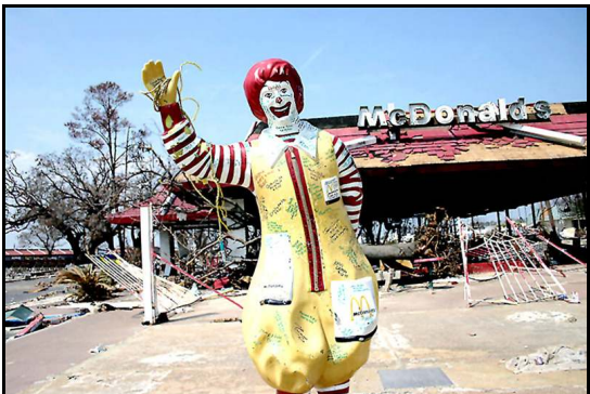
Mississippi Gulf Coast Highway (2005)