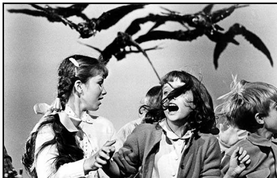
School yard scene in Alfred Hitchcock’s film The Birds (1963)