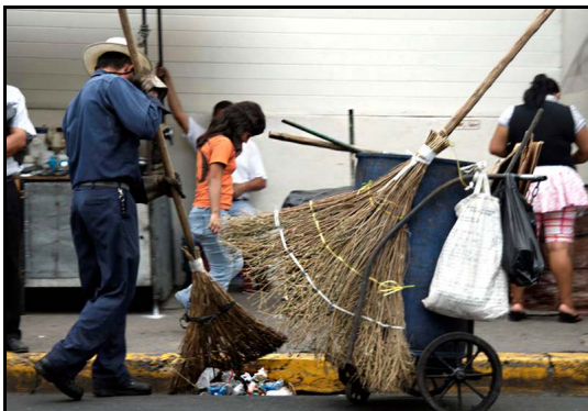
Street Sweeping, San Salvador, El Salvador (2009)

which got a hearty laugh from the gunman and suddenly all was OK — the bad don't fuck with the crazy.