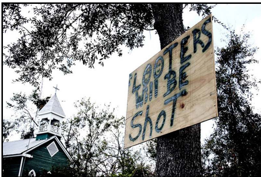
Pearl River, Louisiana (2005)