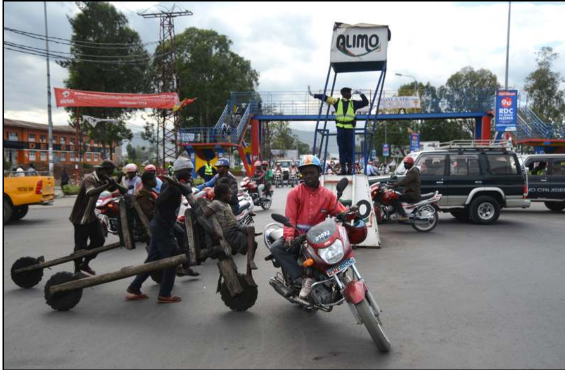
Goma, Democratic Republic of the Congo (2015)

the shelling of Goma itself, to “photograph people in the wild going about the poetry of their everyday lives.”