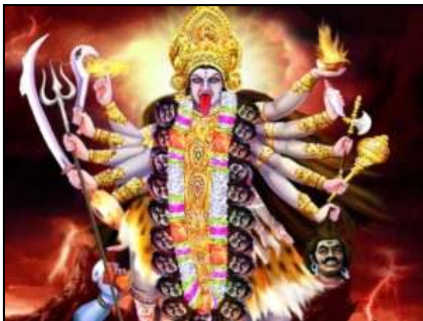
A representation of Shiva

back out the door he came in: "GET THE FUCK OUT OF MY GODDAM SHELTER . . . NOW!!!!!" It worked. After helping immediate victims of the disaster, Smith took time to photograph the effects of Katrina in a variety of locales along the Gulf Coast. Pearl River, LA juxtaposes the church spire's crucifix with a looters-will-be-shot sign; Mississippi Gulf