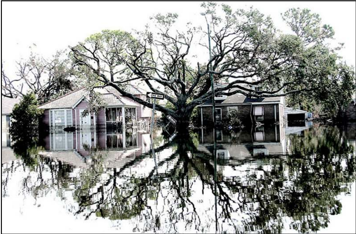
Canal Street, New Orleans, Louisiana (2005)