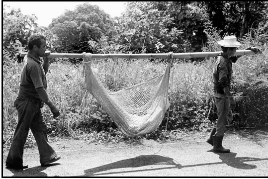
Carrying a Dead Campesino, El Salvador (1984)