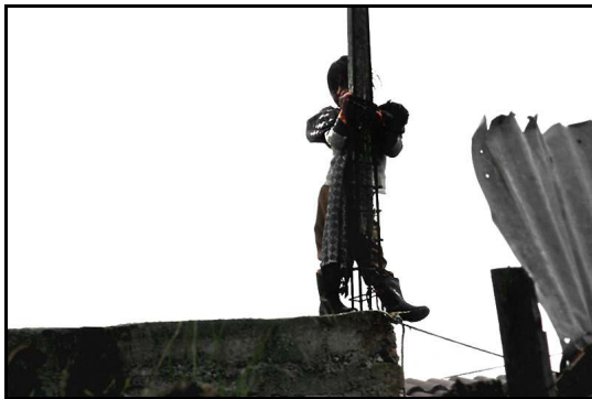
Alleyway Poverty Post Clutter Girl, Jatari Campesino, Ecuador (2007)