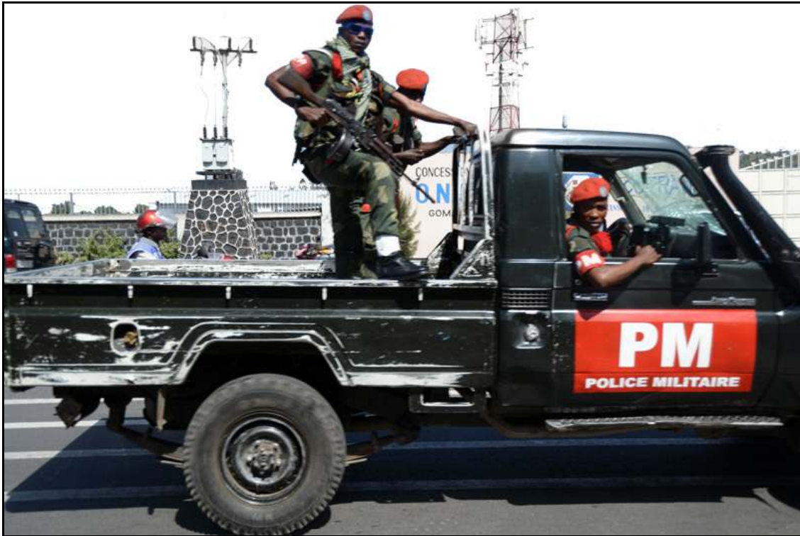
Goma, Democratic Republic of the Congo (2015)

is his written record "Cologne SWAT Squad: Manhandled at the Reunification Opera Riot": "Even when an authority stops me, I'm nearly always able to go over that authority's head to his or her boss and get where I need to go to get the pictures I want to get. However, an exception to that standard occurred on the night of October 3, 1990, German and European Reunification night in Cologne. That night I found myself caught in a demilitarized zone between a huge angry mob of raging M-80-tossing German anarchists and about a hundred camouflaged and fully-armed (rubber bullets) West German SWAT team members." What ensues is a chilling tale of extreme street wisdom in avoiding potential harm.