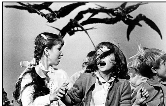
School yard scene in Alfred Hitchcock's film The Birds (1963)