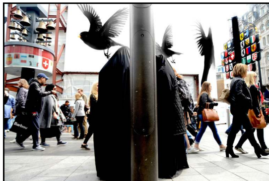
Murmuration of Fear, London, England (2015)

handshakes from the 250 students present. "It had been among the most astounding hours of my astonishing life," he noted.