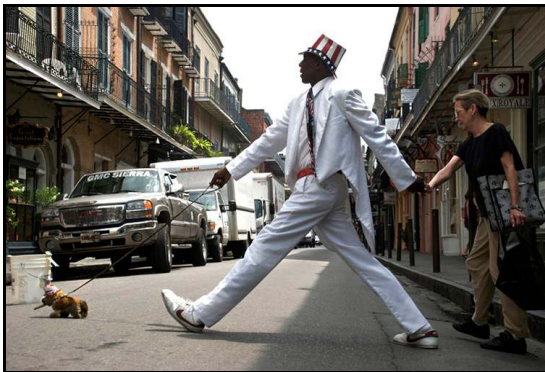
Post-Katrina Morning Busker Big Easy Fist Bump, New Orleans, Louisiana (2010)

— Field notes from New Orleans, LA, 2005, rewritten in 2015