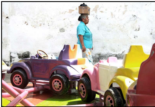
Suchitoto, El Salvador (2009)