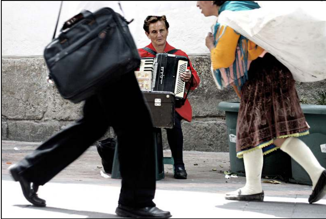
Quito, Ecuador (2007)

The motion and color of city life in Ecuador's capital, Quito, is captured in a shot that figures a well-dressed, briefcase toting, businessman in black walking from frame-left toward frame-center; approaching from the opposite direction is a traditionally garbed woman in a bright yellow blouse, bent over, toting a heavy white bag over her shoulder. Different classes bear different loads. Dead center between these two social opposites (modern versus traditional), doing the urban hustle for coins, is a seated musician in a red shirt plying an accordion. Smith creates here a powerful tension of forces pushing from each side of the frame toward the center, squeezing the musician who squeezes a musical instrument. Class, gender, color, and vectors of motion masterfully come together here to give the viewer a sense of urban life as well as the sheer diversity and energy of the street-life in a land where social inequality is rampant.