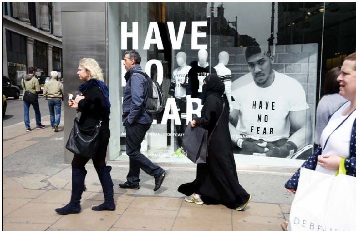
Europe, 2015, Oxford Street, London

events. The bells in the upper left corner suggest a For Whom the Bell Tolls reference. In Hemingway's novel a dynamiter is featured. The madly flapping birds recall scenes from Hitchcock's eerie film The Birds (1963), where the protagonists never know when terror will hit, when a seemingly innocent bird will turn and try to kill children at a school; by the way, a bell top the school. It is a premonition of terror to come to London streets (what the average Londoner fears). The black birds and the two women, backs to us, clothed in black boshiya , evoke Western symbols of shrouded Death, while the touches of red on either side of the dark figures below the bells and the birds suggest blood. The photograph symbolizes a post 9-11 world where a mood of anxiety accompanies us city-strollers in the West, where a sudden burst of birds into the air can suggest the sudden explosion of a bomb in a backpack.