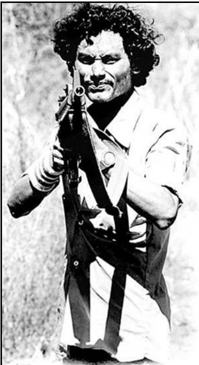
Suchitoto, El Salvador (1984)

— Field note from Guazapa, El Salvador, 1984