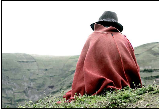
Jatari Campesino, Chimborazo, Ecuador (2007)

Coast Highway ironically places a smiling and waving Ronald McDonald standing, oblivious, before a wrecked McDonald's concession. However, Canal Street, New Orleans, LA captures a surreal moment in the flood when land and sky conspire to astonish us, producing within a reflection of tree limbs that appropriately figures Shiva, the Destroyer and Creator in Hindu mythology. The image, like Smith's Murmuration of Fear shot in London, is more a symbol for the destruction and the eventual reconstruction of New Orleans than just a document of its disastrous flooding.