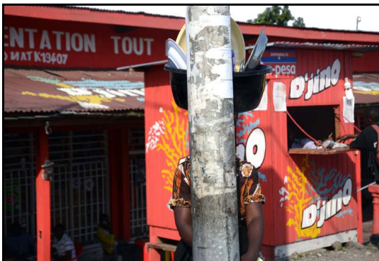
Goma, Democratic Republic of the Congo (2015)

Travelogueing the Dark Side: The ExtremeOphile Field Notes of a One-of-a-Kind Lifetime Art Project is a tome recording this intrepid photographer's adventures across time and space, a sedimentation in paper and ink of his multifarious performances as a global street photographer, where danger is a key ingredient of such performances: "It's something inside me that pulls me toward recording violent moments on 'inaccessible streets,' areas photojournalists either won't go or where they remain for a short time." Hence, one must understand Smith's accomplishments not just in an analysis of his superbly composed imagery per se , but of the whole performance of his global trekking activity into the world's most dangerous places: Cuba in the 1960s; East Germany just after the fall of the Berlin Wall, prior to unification; Prague emerging from Communist rule; El Salvador during the bloody civil war (in 1982 for 3.5 months and in 1984 for two weeks), documenting victims of Right-Wing death squads; Rio de Janeiro's infamous Rocinha favela , where he was roughed up by machine-gun toting minions of a local drug lord, his camera grabbed; Peshawar near