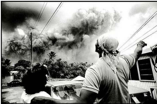
Soufrière Hills Volcano Erupts (1997)

— Francisco Goya ( The Disasters of War )