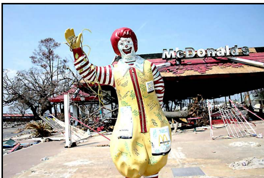
Mississippi Gulf Coast Highway (2005)